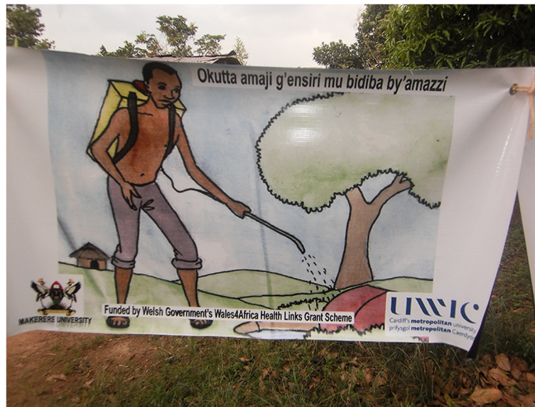
Figure 1 One of the posters used for training community health workers and sensitization.

fliers were distributed to the community after the training so as to give them out to others who did not attend. These materials were translated into the local language ( Luganda ) so as to facilitate learning among the population.