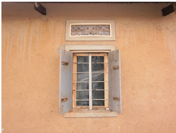
Figure 3 A window and ventilator on one of the demonstration houses with complete mosquito proofing.

the number of household members and the available functional nets at the time. Households received between two and six LLINs. These interventions were carried out after educating the beneficiaries on the importance of using the methods in the prevention of malaria. These demonstration households were important in promoting the integrated approach among the community. The interventions were not only beneficial to the members of the demonstration households but also the entire community who appreciated the integrated approach, which they had been taught during the project training. Indeed, several community members on seeing the demonstration households expressed interest to the project team in having the interventions also implemented in their houses. In addition, villages neighbouring those involved in the project requested the project team to extend the interventions to their areas. However, this was not possible mainly due to limited resources. It was the responsibility of members of