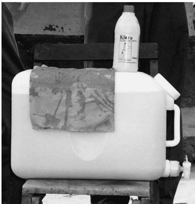
FIGURE 1. The safe water system. It is composed of a 20-liter polyethylene vessel with a spigot that prevents recontamination, a bottle of 0.5% sodium hypochlorite solution, and a locally produced cloth. Twenty liters of water are poured through the cloth into the vessel and one or two capfuls (equivalent to 10–20 mL) of sodium hypochlorite solution are added for disinfection.

the study between January and March 2001 (Figure 2). After written, informed consent was provided, study staff visited participants' homes to conduct a census and obtain consent from household members. Consent forms and questionnaires were translated into six local languages and back-translated into English. A household was defined as persons who shared a hearth and slept in the same house or cluster of houses for at least five days of the week for the preceding three months. A finger stick sample of blood was collected from household members on filter paper for HIV testing. All persons were encouraged to receive HIV test results and counseling at home or at the project clinic at Tororo Hospital. The HIV test result counseling was provided to study participants alone, or with partners. For participants 10–17 years of age, counseling included both the child and parent or legal guardian, and for those 0–9 years of age, only the parent or legal guardian was counseled. Consent for HIV testing or receiving test results were not requirements for enrollment, but only persons for whom HIV test results were available were included in analyses.