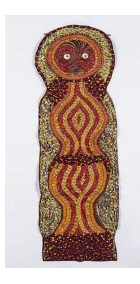
19 Gateja Sanaa Untitled (2017) Mixed media