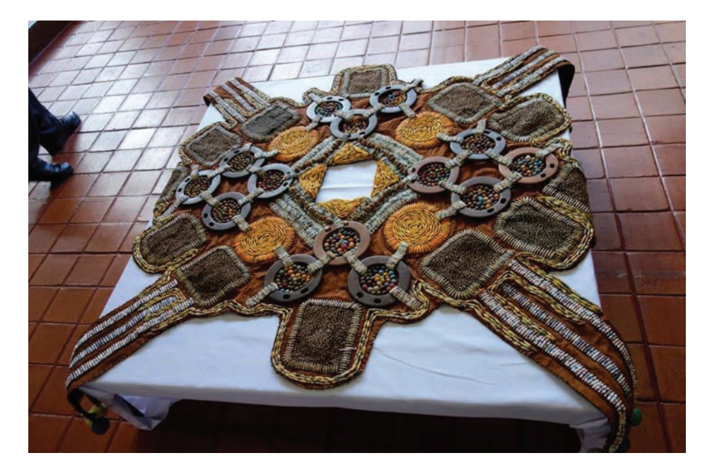
17 Sanaa Gateja The King's Costume (2017) Mixed media This art work was exhibited at the Ekifananyi kya Muteesa exhibition (2017) at the Institute of Heritage and Conservation at the Makerere University Art Gallery in Uganda. Photo: Sanaa Gateja

18 Sanaa Gateja The Power Costume (2017) Mixed media This piece was exhibited at a gallery in Holland. Photo: Gateja Sanaa