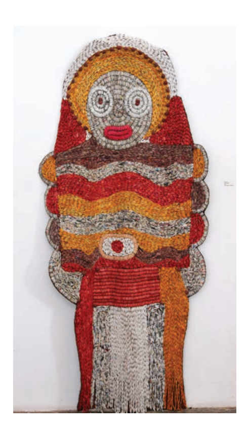
15 Sanaa Gateja In Power (2017) Paper beads on bark cloth; 194 cm x103 cm

16 Sanaa Gateja Power (2017) Paper beads on bark cloth