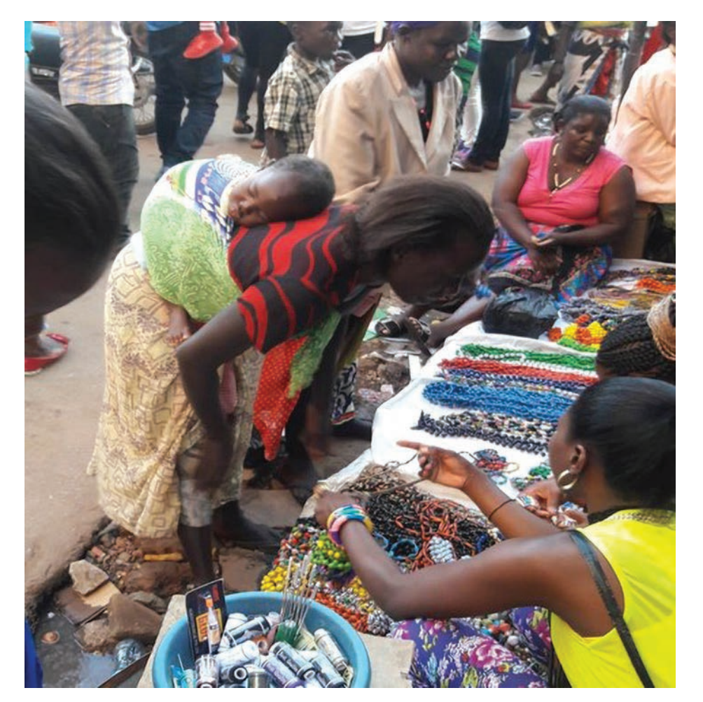
12 Women sell their paper beads from a pavement along Ben Kiwanuka Street in Kampala, Uganda. Many women have improved their lives through this trade. With the paper beads displayed on plastic sacks, the mother in the foreground, with her baby strapped to her back, negotiates with a customer. In this interaction, while the mother reproduces her role as a child nurturer in private space, her presence in the public economy recreates the static definition of the private and public space to produce shifts in the spaces a mother can occupy.

domestic objects in relation to women and domestic space (Figs. 3, 8). Several thin layers of varnish are applied to yield a more polished look (Figs. 9–10). The strings of varnished beads are spread out in an open environment to dry (Fig. 1). They are later unstrung and stored in sacks (Fig. 2) for assembly into accessories, including necklaces, bags, and earrings (Fig. 11)