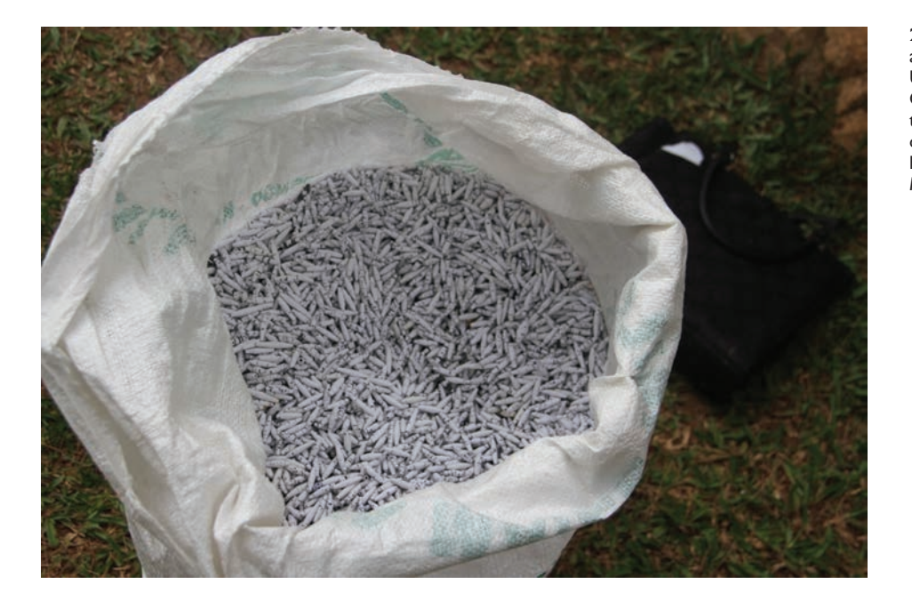
2 Unpainted paper beads stored in a plastic sack at Gateja Sanaa's compound in Lubowa-Kampala, Uganda where the finishing stages take place. Gateja commissions different women to make the beads. He distributes the cut paper strips to different women, who roll the beads from their homes and later return them to him for payment.